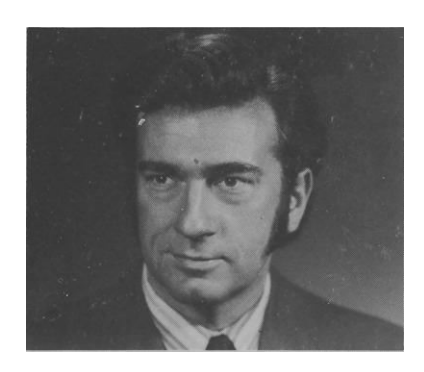
Originally published in French as Le Camp Des Saints, 1973

And when the thousand years are ended, Satan will be released from his prison, and will go forth and deceive the nations which are in the four corners of the earth, Gog and Magog, and will gather them together for the battle; the number of whom is as the sand of the sea. And they went up over the breadth of the earth and encompassed the camp of the saints, and the beloved city. —APOCALYPSE 20