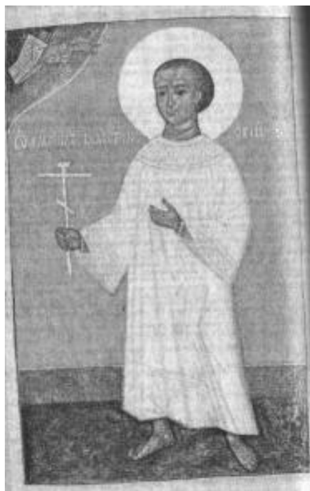
The child-martyr St. Gabriel of Bialystok, done to death by the Jews in 1690

Thirty years later the surrounding land was struck with a horrible epidemic. Peasants sought to bury their children as close as possible to Gabriel's grave, believing in his power of heavenly intercession and patronage of deceased children. During one burial Gabriel's grave was damaged, revealing his imperishable remains. This happened in 1720.