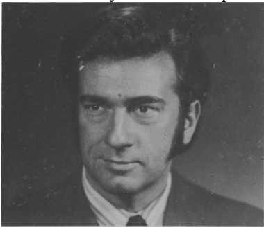
Originally published in French as Le Camp Des Saints, 1973

And when the thousand years are ended, Satan will be released from his prison, and will go forth and deceive the nations which are in the four corners of the earth, Gog and Magog, and will gather them together for the battle; the number of whom is as the sand of the sea. And they went up over the breadth of the earth and encompassed the camp of the saints, and the beloved city. —APOCALYPSE 20