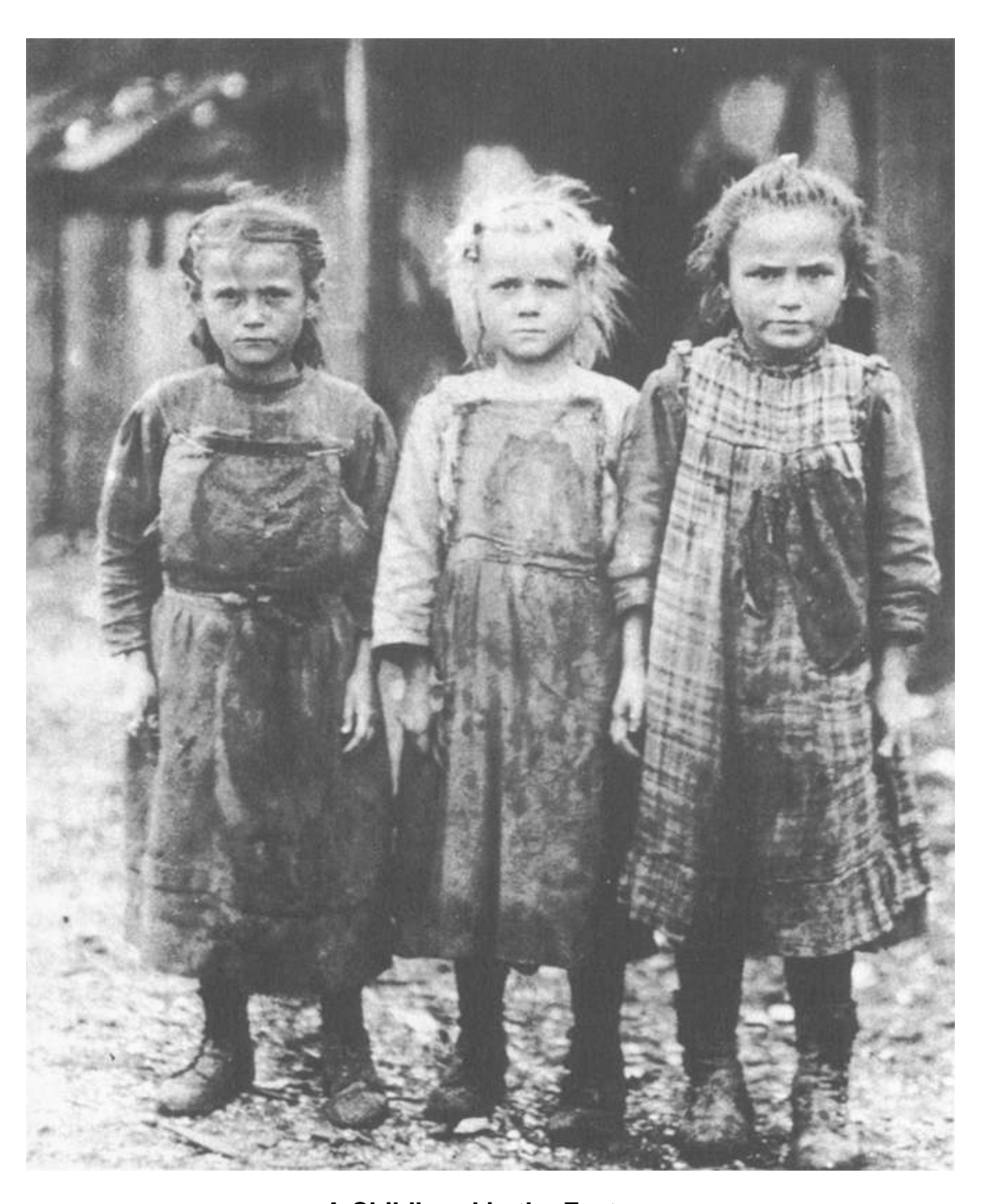
A Childhood in the Factory

The British and American Factory System of the Industrial Revolution was staffed mainly by enslaved ('indentured') White children who were forced to work, as children had never worked before"—sixteen hours a day, locked into a building, without breaks (except to go to the "necessary"). Food was taken standing up, while tending the primitive machinery which mutilated tens of thousands of children. For falling asleep or talking, White girls and boys were beaten with a leather strap or a "billyroller," a murderous iron bar.