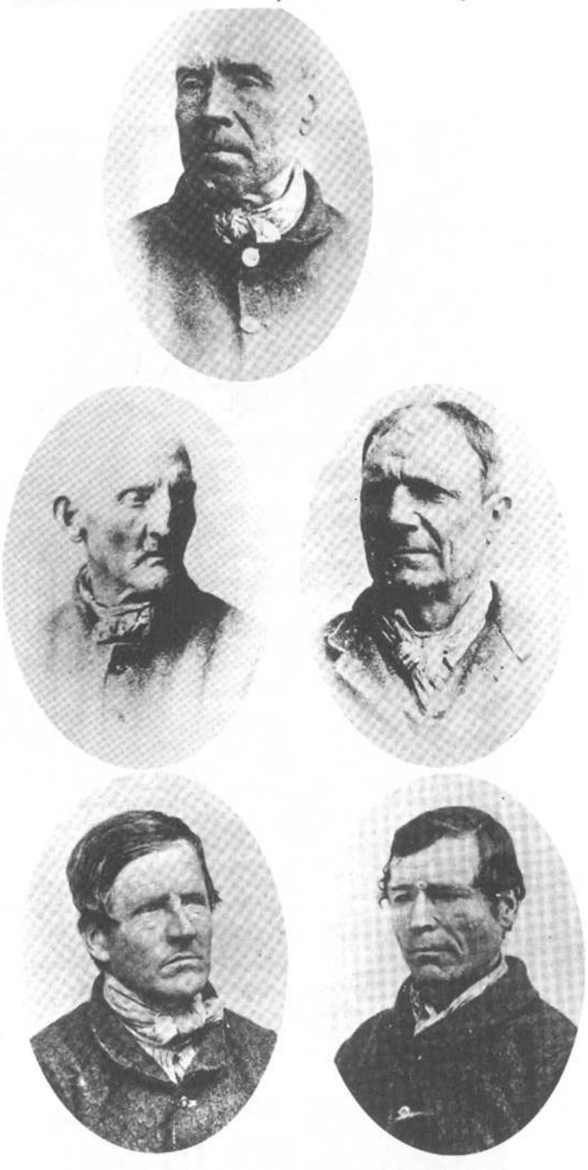
Survivors of White Slavery