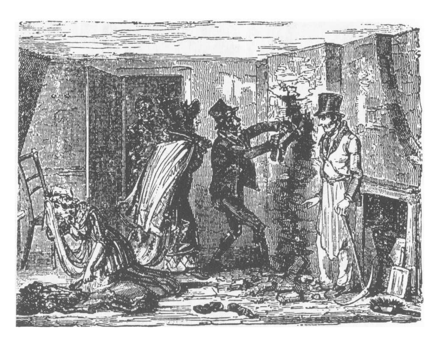
The Death of Two "Human Brooms"

Poor White children were a very expendable commodity in Georgian and Victorian England, as this period print of an actual chimney-sweeping accident illustrates. Enslaved to a master of chimney sweeps from as young as the age of four, White boys were forced to climb inside suffocating and cramped flues and clean them. They received no pay, begged their food and slept in cellars. Many died from accidents, beatings and cancer brought on from constant contact with ash and cinder which they had no opportunity to wash from their skin.