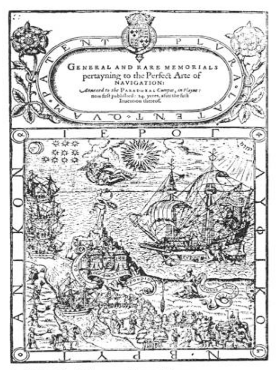
11 John Dee, General and rare memorials, 1577, title-page

Thus, the first legal agreement or constitution in the New World was followed in 1661 by a Declaration of Liberties, dated June 10, 1661, in General Court, which included: "2. The Gouvernor & Company are, by the pattent, a body politicke, in fact and name. 3. This body politicke is vested with power to make freemen .... " This Declaration is an important document in the history of this nation, because It announced that we now possessed the power of sovereignty, that is, the right to make freemen. On October 2, 1678, the colonists boldly announced that "the laws of England are bounded within the fower seas, and doe not reach America."