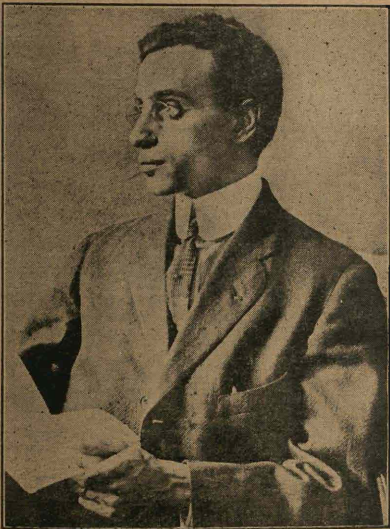
LEO M. FRANK, the Accused.