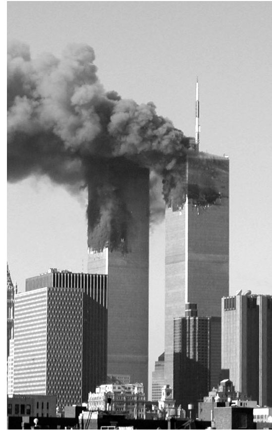
Above: The destruction of the twin towers of the World Trade Center was a wake-up call to Americans. Our open borders policy toward immigration of Middle Easterners, coupled with aggressive support of Israel and attacks on Moslem nations overseas, is the opposite of the policy we need to ensure our safety: Close our borders and remain neutral in the Middle East.

Israel's brutality against the Palestinians and its decades-long occupation of other people's land is not something that Ameri-