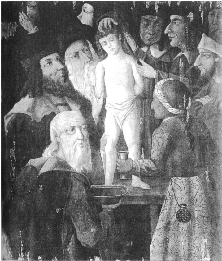
Fig. 21. Alto Adige School, Martyrdom of Simonino , first half of 16th century, Trent, Provincial Museum of Art.