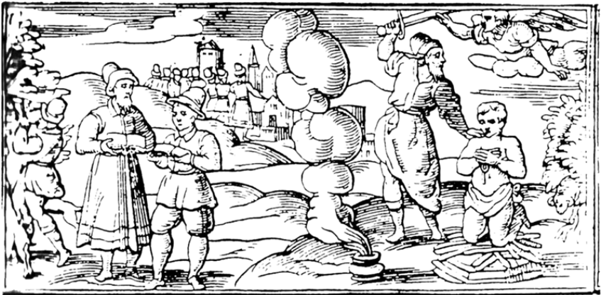
Fig. 12. Sacrifice of Isaac , woodcut from the Passover Haggadah, Venice, Giovanni De Gara, 1609.