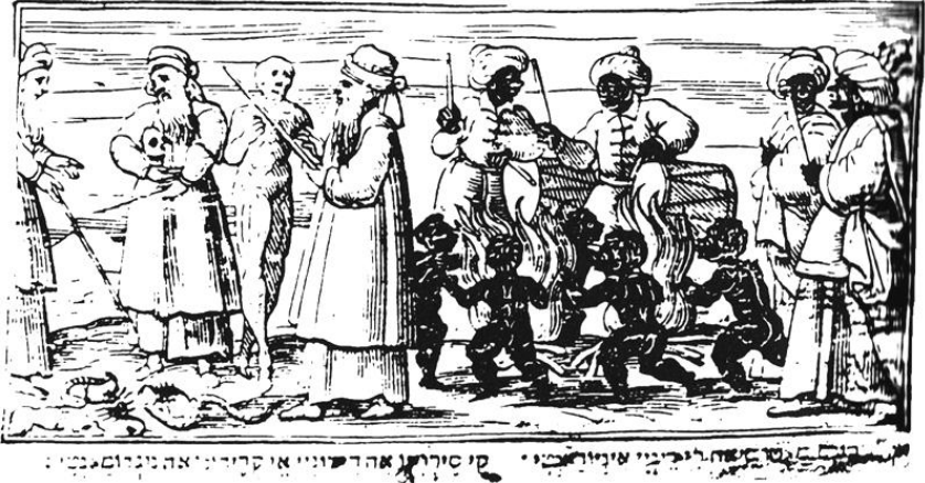
Fig. 7. Enchanters and Necromancers , woodcut from the Passover Haggadah , Venice, Giovanni De Gara, 1609.