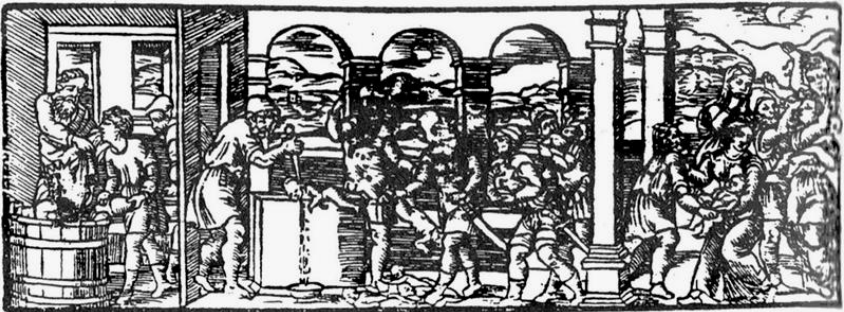
Fig. 4. The Pharaoh's Bath of Blood , woodcut from the Passover Haggadah , Mantua, Giacomo Rufinelli, 1560.