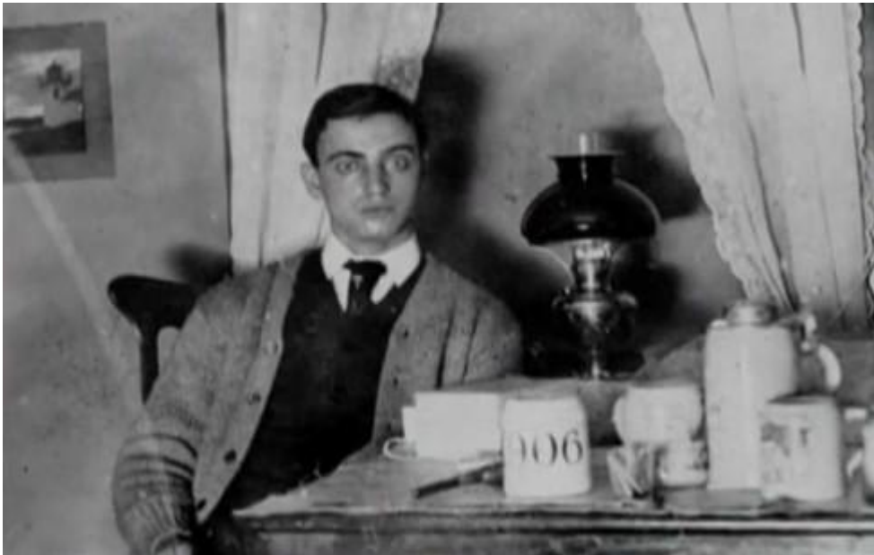
In this rare photograph from his days at Cornell University, Leo Frank stares wide-eyed at the camera, a characteristic expression for him.

It is most interesting that a single man, expressing his opinion that Leo Frank was a "damn Jew" and ought to hang, was something that a public-spirited citizen in 1913 Atlanta thought he ought to report to the authorities. This hardly corresponds with the atmosphere of "pervasive Southern anti-Semitism" that modern Frank supporters say existed. On the contrary, it speaks of an atmosphere in which such sentiments were strongly deplored, and even considered beyond the pale of socially acceptable behavior and expression.