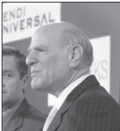
Media Boss Barry Diller: TV, films, theme parks

In 1945, four out of five American newspapers were independently owned and published by local people with close ties to their communities. Those days, however, are gone. Most of the independent newspapers were bought out or driven out of business by the mid-1970s. Today most "local" newspapers are owned by a rather small number of large companies controlled by executives who live and work hundreds or even thousands of miles away. Today less than 20 percent of the country's 1,483 papers are independently owned; the rest belong to multi-newspaper chains. Only 104 of the total number have circulations of more than 100,000. Only a handful are large enough to maintain independent reporting staffs outside their own communities; the rest must depend on these few for all of their national and international news.