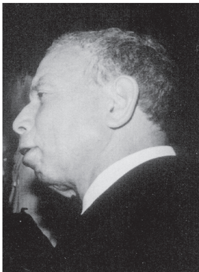
Media Boss Samuel Newhouse: Newspapers, magazines