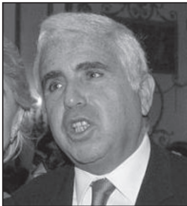
Media Boss Melvin A. Karmazin, Viacom President, COO & Director. When a reporter asked then-CBS president Mel Karmazin why he wanted a merger with Sumner Restone's Viacom, he replied: "This is the deal I've wanted to make, I think, from the time I was bar-mitzvahed."

The best known of the smaller media companies, DreamWorks SKG, is a strictly kosher affair. DreamWorks was formed in 1994 amid great media hype by recording industry mogul David Geffen, former Disney Pictures chair-