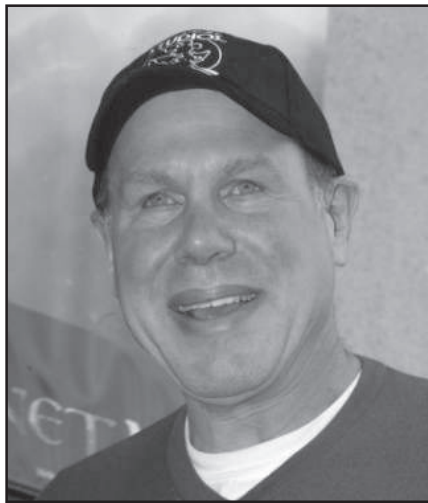
Media Boss Michael Eisner: Television, films

Because there are differences in degree, however, most Americans fail to realize that they are being manipulated.