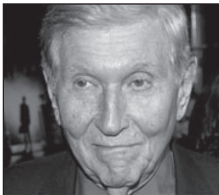
Media Boss Sumner Redstone: TV, films, books

Disney. The second-largest media conglomerate today, with 2002 revenues of $25 billion, is the Walt Disney Company. Its chairman and CEO, Michael Eisner, is a Jew.