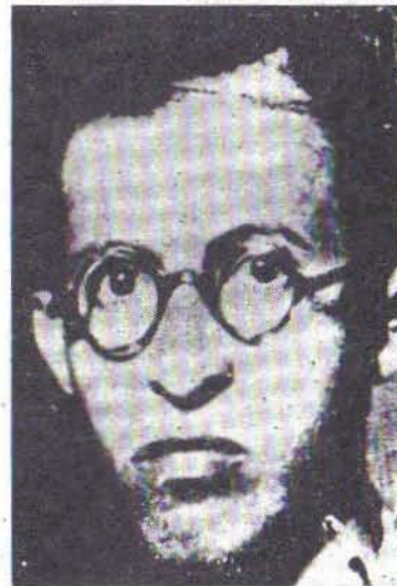
MENACHEM WOLFOVITCH BEGIN