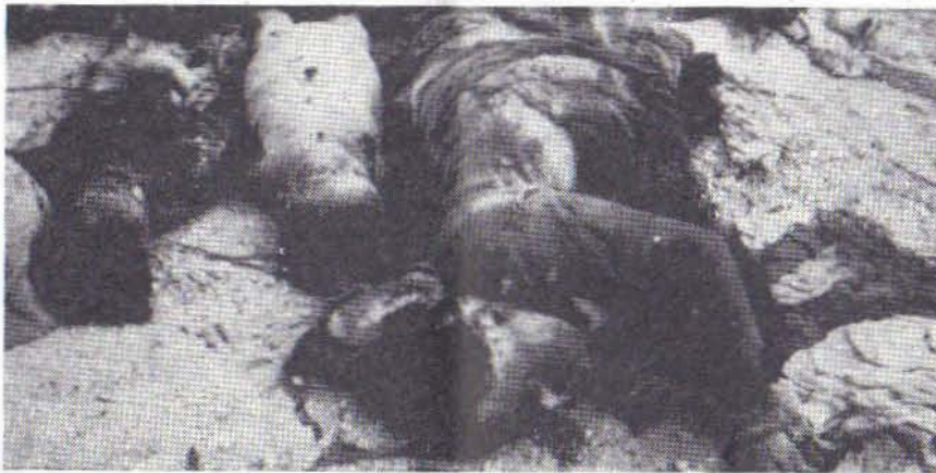
JEWISH MASS MURDER AT QIBYA The remains of an Arab family

Leumi, in a press interview in New York on December 28th, 1950 (see also his book, The Revolt ).